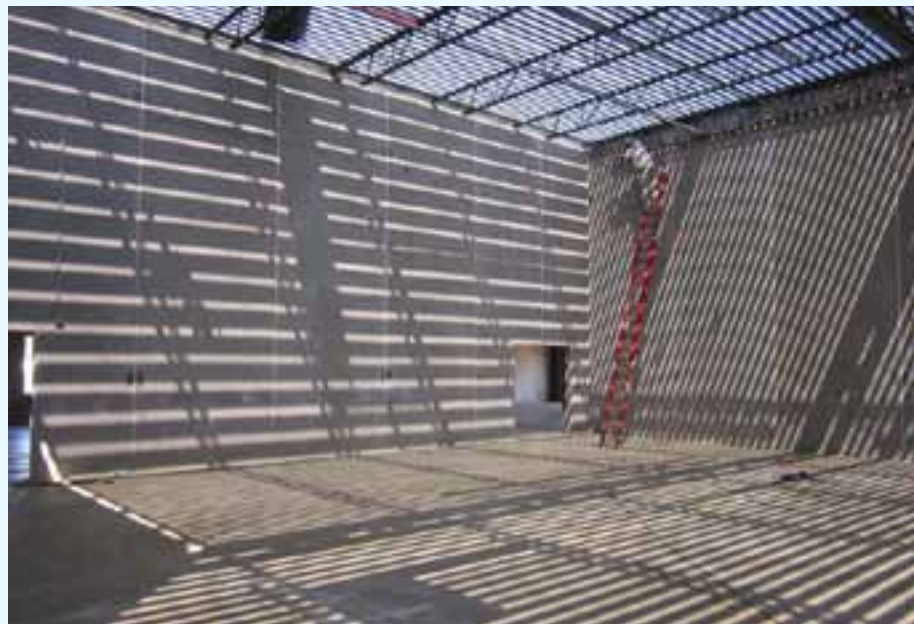
Construction crews are busily erecting a new 37,000-square-foot permanent school building for Imagine Andrews.